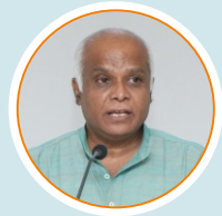
Shri Chittaranjan Sarangi