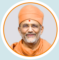
Param Pujya Tyagvallabh Swami ji

Friday, February 9th 2024, 10:00 - 11:00 am | Step Auditorium